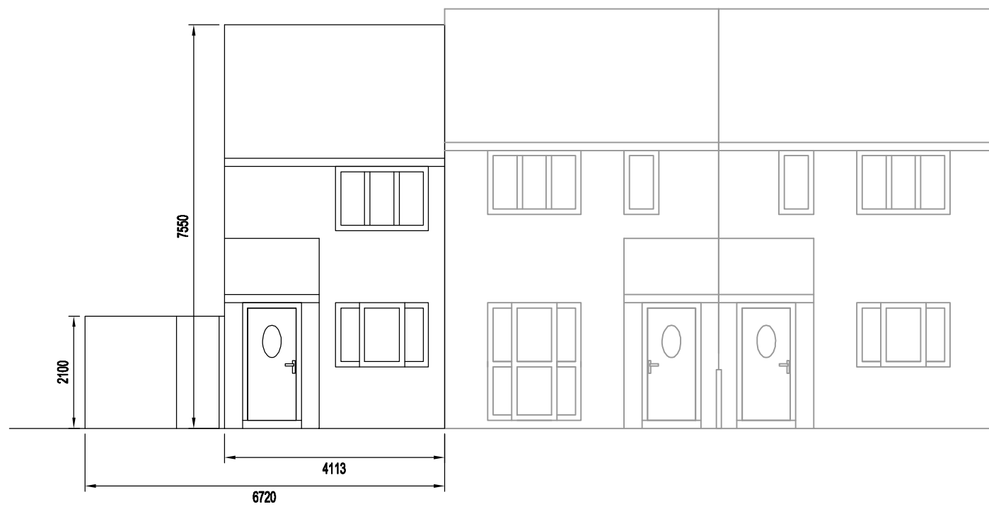
EXISTING ELEVATION A-A 1:100